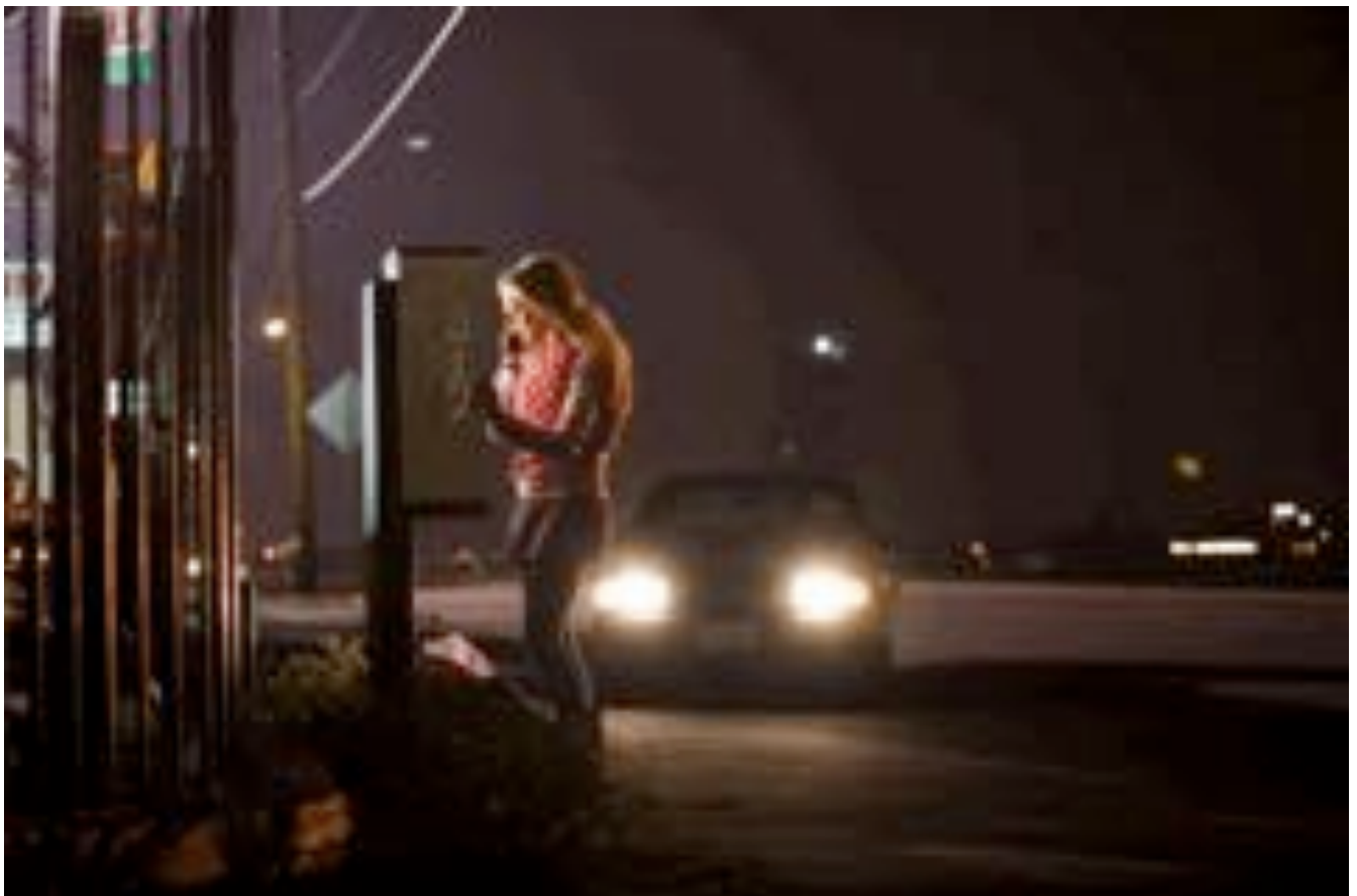
"THE MERCY LIST" LOOK BOOK