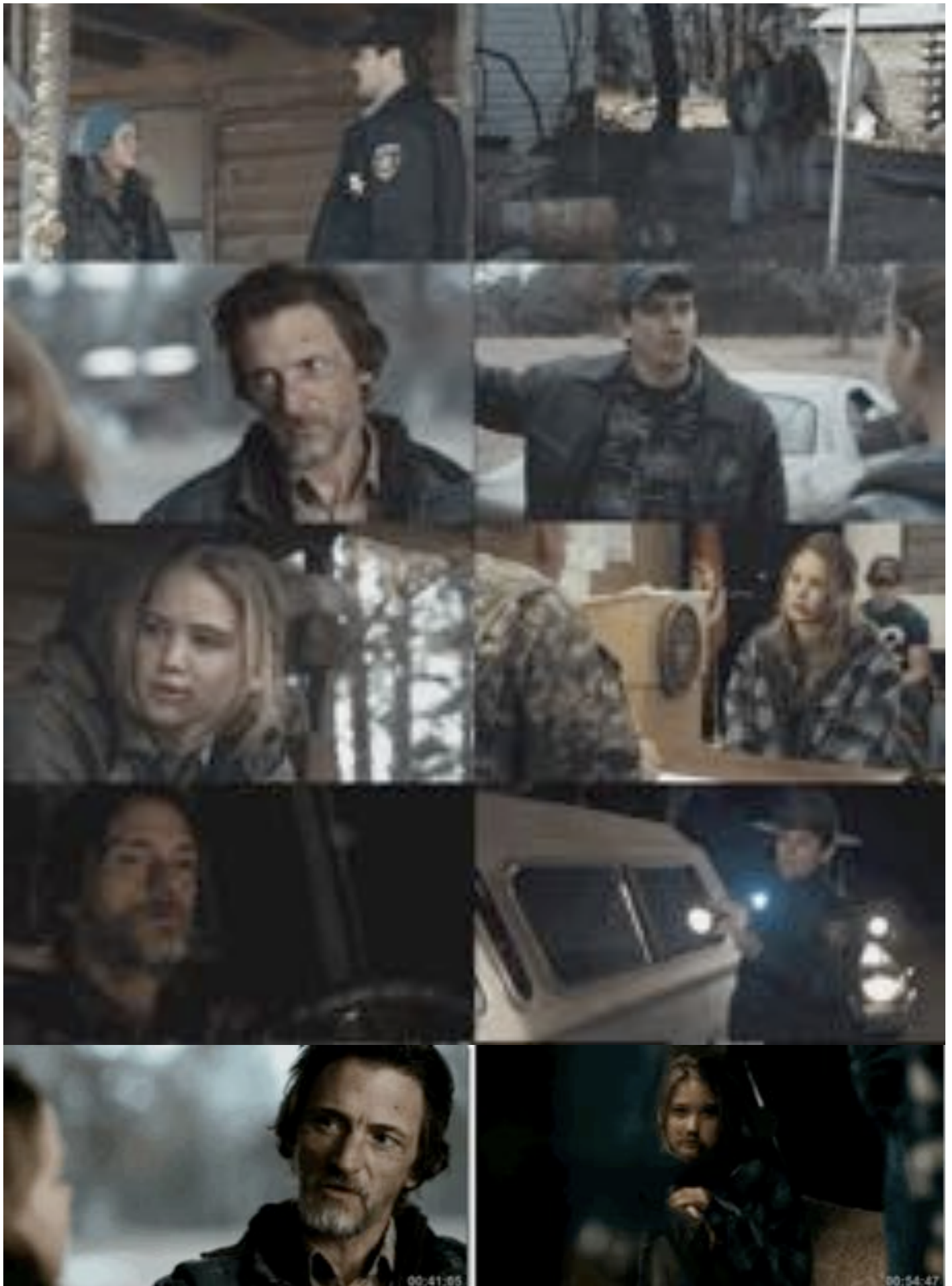
"THE MERCY LIST" LOOK BOOK