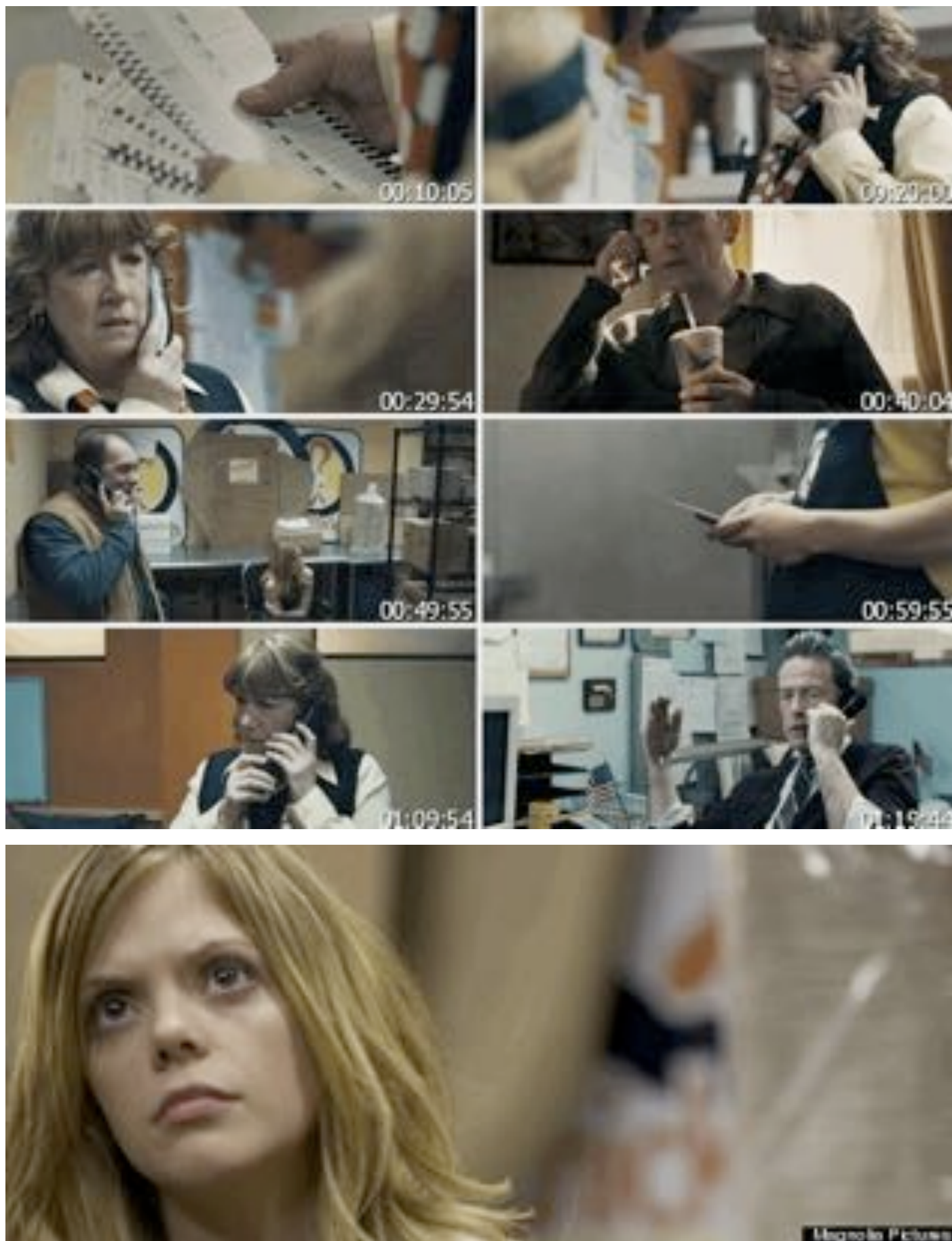
"THE MERCY LIST" LOOK BOOK