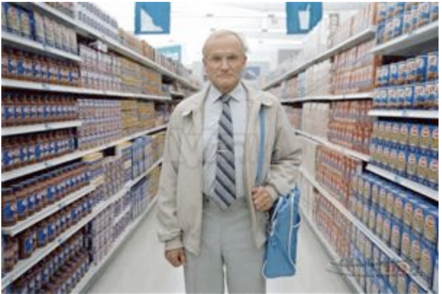
"THE MERCY LIST" LOOK BOOK