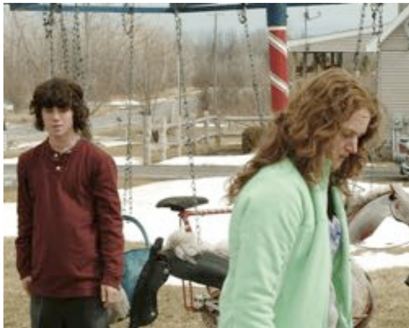
"THE MERCY LIST" LOOK BOOK