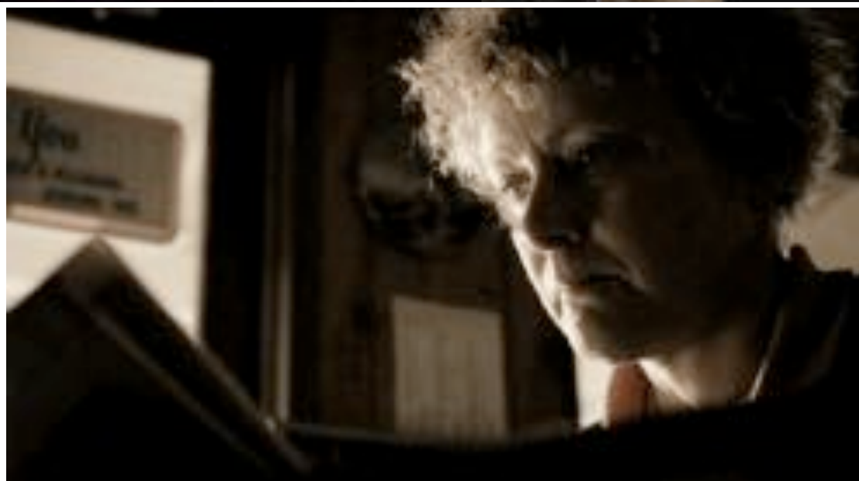
"THE MERCY LIST" LOOK BOOK