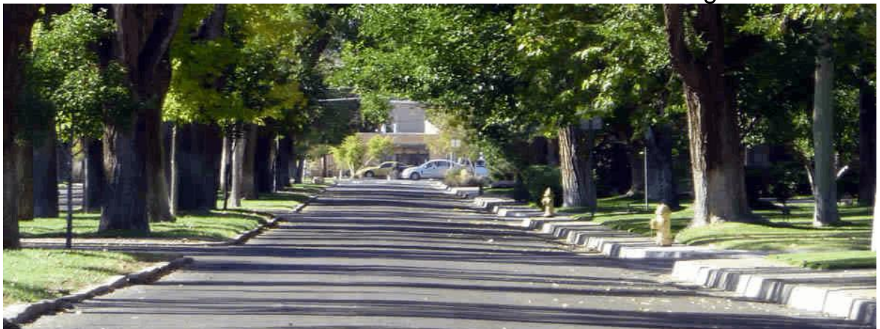
And the type of neighborhood in which he lurks at night.