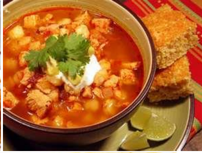
Red chile posole & cornbread.