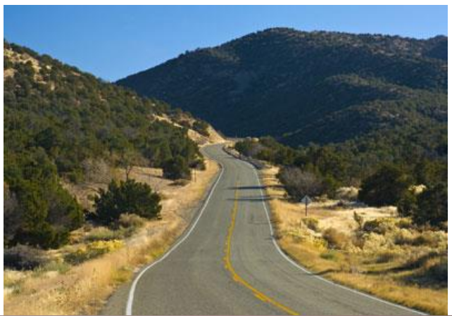
The Sandia Mountains – “sandia” means watermelon in Spanish; the mountains lit up bright pink at sunset.