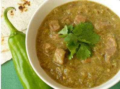
Green chile stew