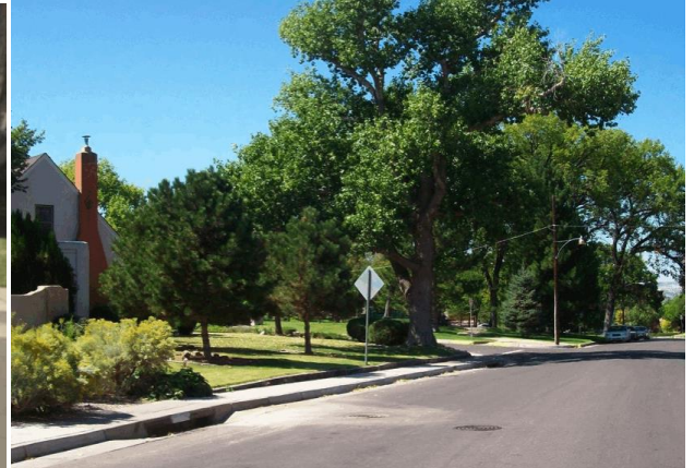
Typical house that Tanner would live in.