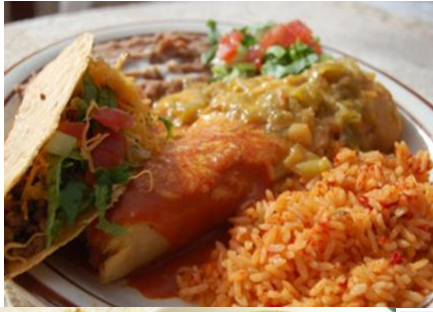
Tacos & tamales