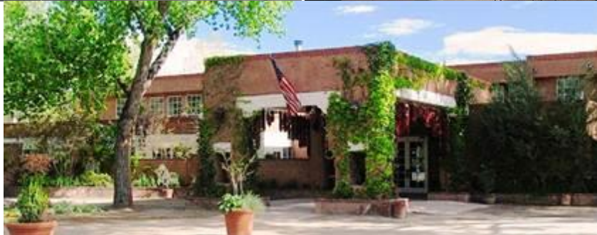
"The Mercy List" ~ Location