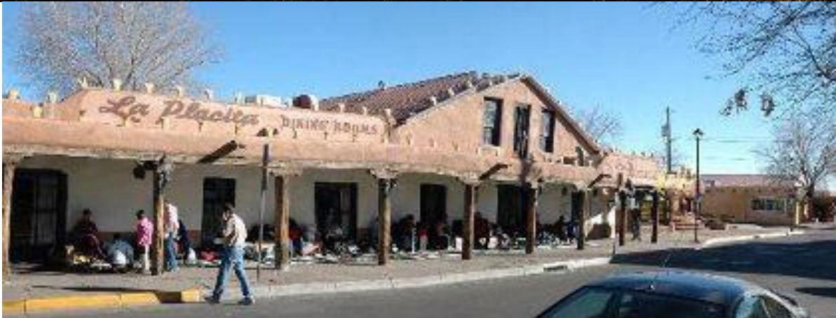
"The Mercy List" ~ Location